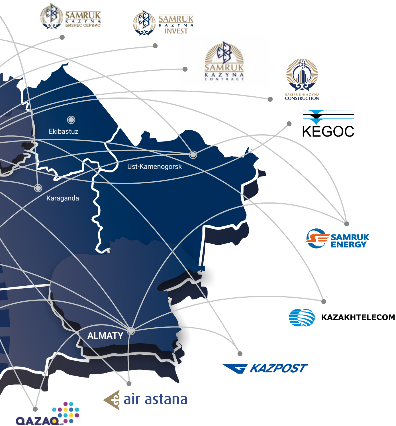
The structure of the Fund's Group, according to the Methodology for classifying legal entities whose shares (participation interests) directly or indirectly belong to the Fund, as of December 31, 2021